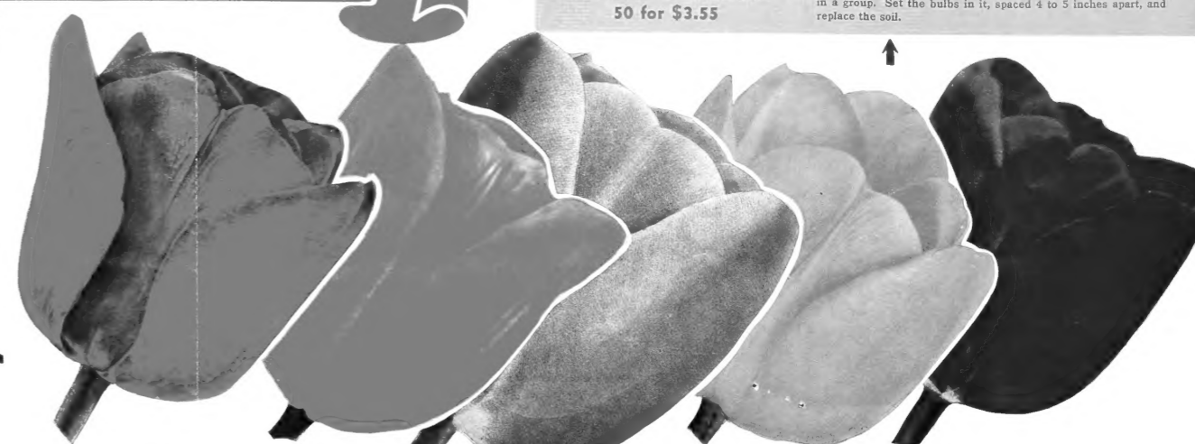
GLORIA SWANSON 12 for 95c NIPHETOS 12 for 95c SCOTCH LASSIE 12 for $1.00 CLARA BUTT 12 for 85c LA TULIPE NOIRE 12 for $1.00

Collection H This sampling of Darwin Tulips brings you a beautiful blend of colors. Each variety in the Blue Ribbon Collection is packed and labeled separately to enable you to make whatever color combinations please you. Packed and wrapped in Holland in special perforated bags, these bulbs are handled with extreme care and will reach you in the best condition. 10 bulbs each of the Ten Blue Ribbon varieties illustrated to the left and right. 100 for only $7.20 Separately packed and labeled Collection J 5 bulbs each of the ten Blue Ribbon varieties 50 for $3.80